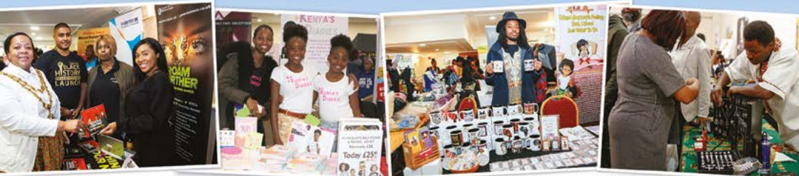
Exhibit Your Brand

Exhibit your business or organisation at the Black History Activity Books Launch 3.0 as a great way to promote and gain mass exposure.